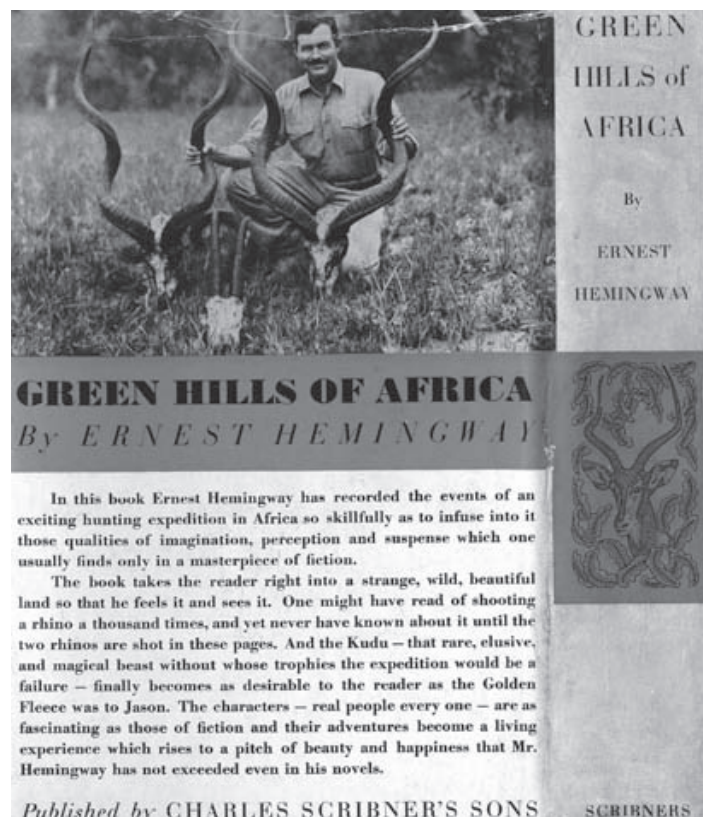
The two variants of Hemingway's Green Hills of Africa . Left: First issue. Right: Second issue.